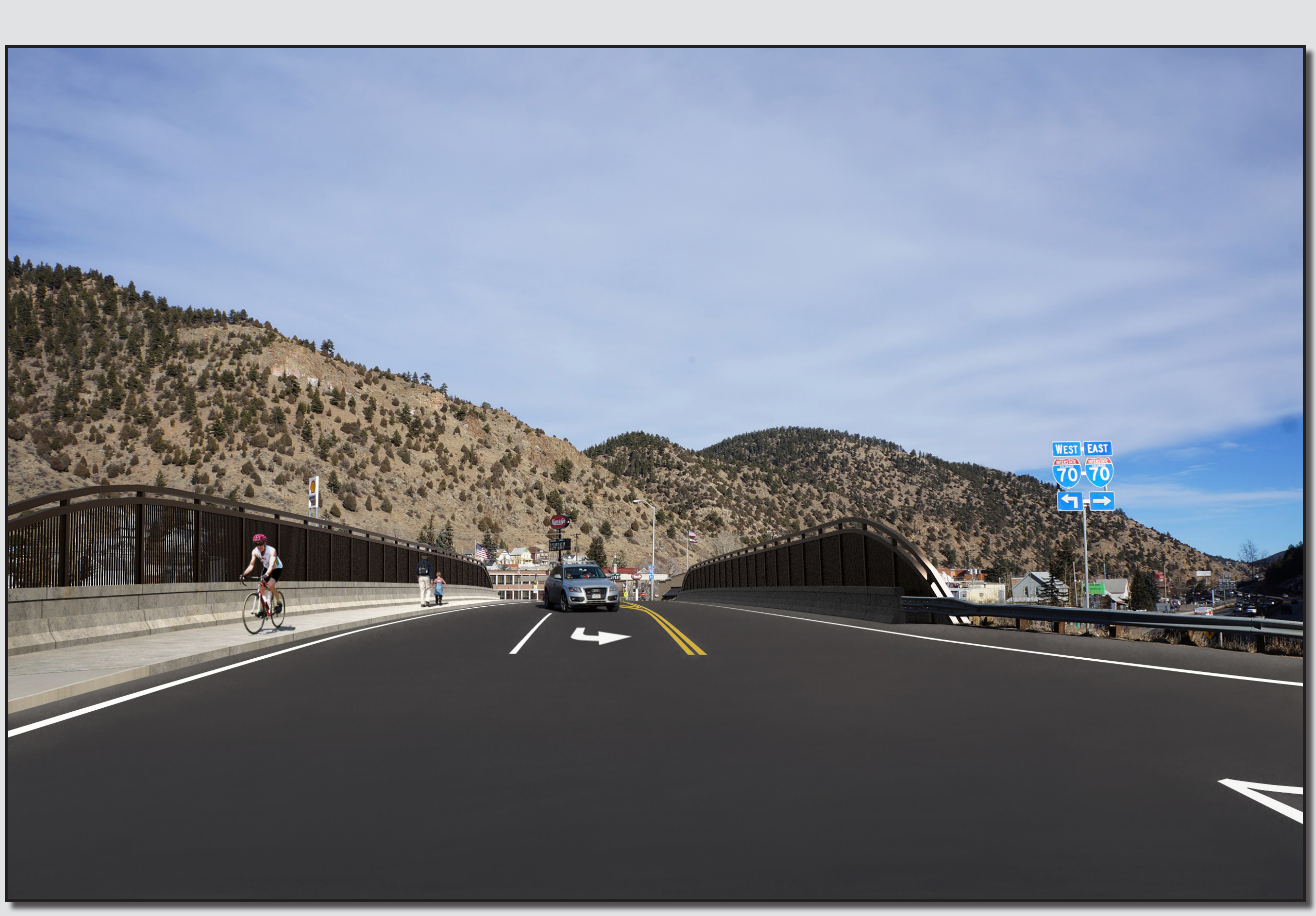
PROPOSED VIEW: SH 103 BRIDGE REPLACEMENT