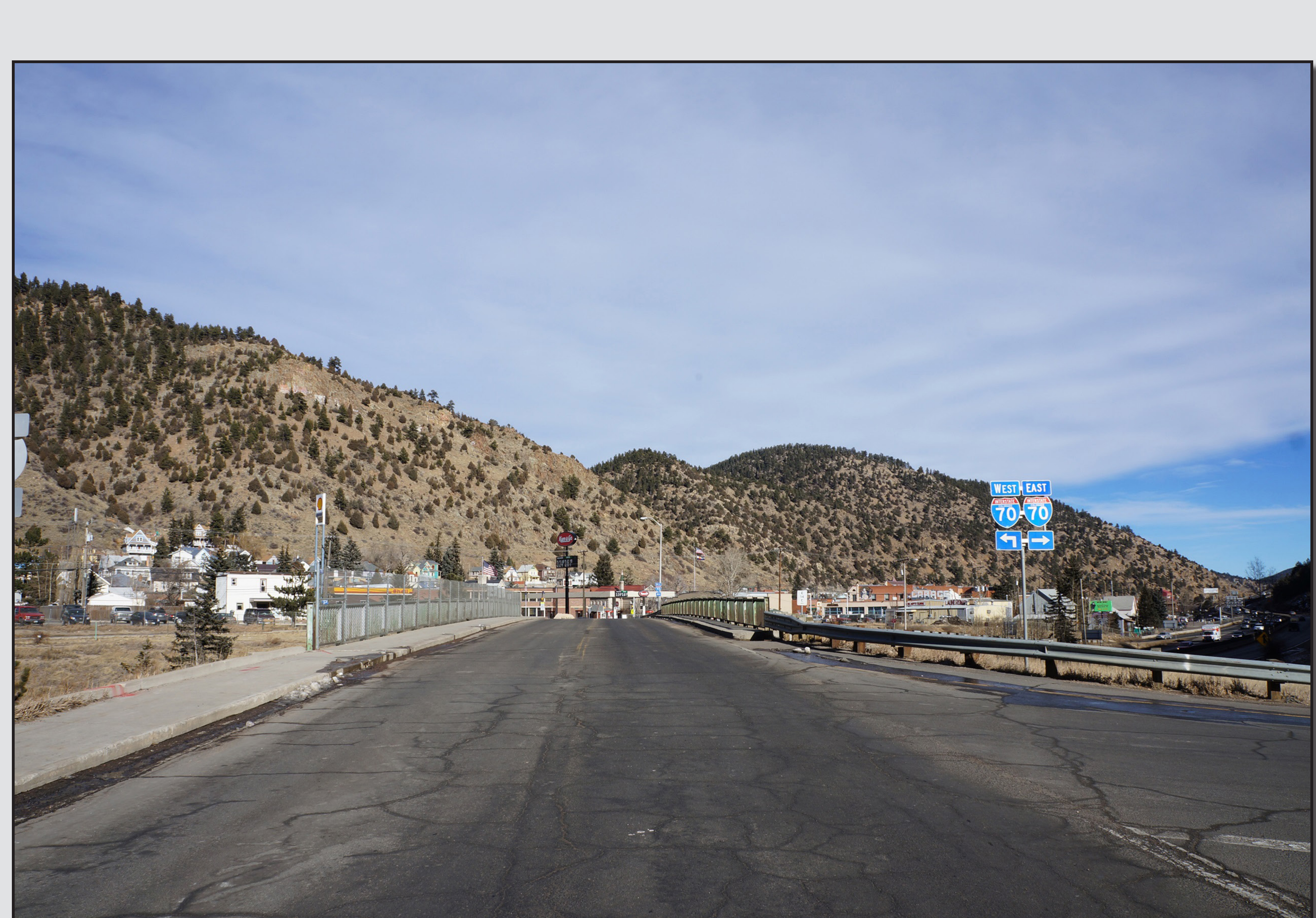
EXISTING VIEW: SH 103 BRIDGE REPLACEMENT

Both bridges will include wider shoulders. The SH 103 Bridge will be widened to include a new, 10-foot multi-use path on the west side.